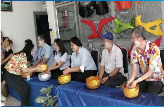
Organized Songkran Festival activities, including a traditional water-pouring ceremony for elders, to encourage employees to preserve and continue cultural heritage.