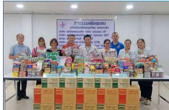
distributed Children's Day gifts to the communities surrounding the company.