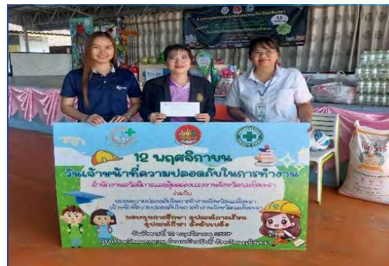
Participated in providing scholarships, educational materials, sports equipment, and fire extinguishers to Wat Khlong Suan School, Ban Pho District, Chachoengsao Province.