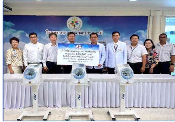
Donated funds for the purchase of medical equipment to Nopparat Rajathanee Hospital.