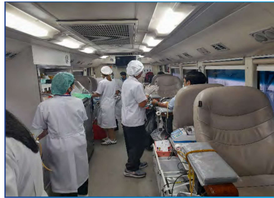
Participated in blood donation activities with the National Blood Center, Thai Red Cross Society.