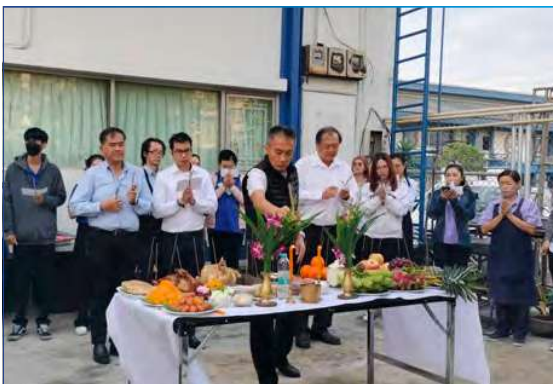
Participated in the merit-making ceremony by offering alms of dried food and rice to monks on the occasion of bidding farewell to the old year and welcoming the New Year.