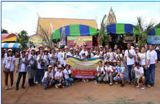
The Kathin unity ceremony at Wat Phetcharam, Phetchabun Province, was held to raise funds for the restoration of monks' residences.

Corporate Social Responsibility activities are as follows: