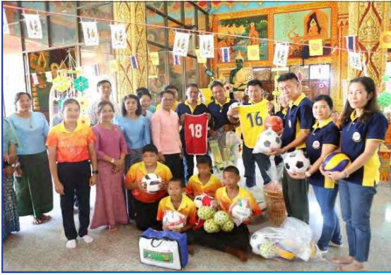
Participated in donating sports equipment and educational supplies to Wat Phetcharam School, Phetchabun Province.