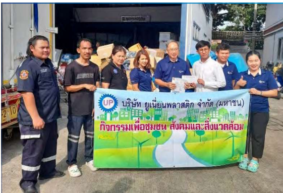
Participated in donating funds to assist flood victims in Chiang Rai Province through the Rom Sai Rescue Foundation.