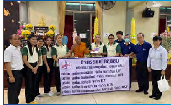
Participated in the Candle Offering Ceremony at Wat Bamphen Nuea and Wat Bang Pheng Tai.