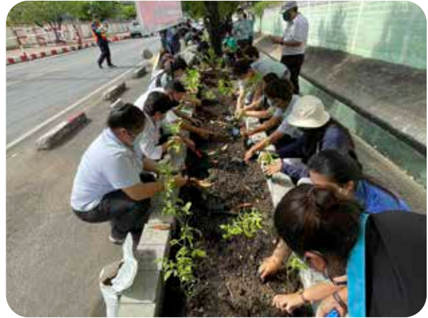
On Monday, 5 June 2023, the Company participated in the “Save the World, Reduce Plastic” activity with Bang Chan Industrial Estate Office and companies in Bang Chan Industrial Estate. On Wednesday,