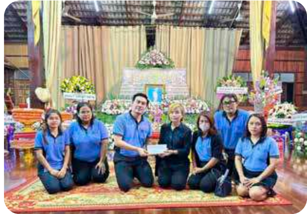
On Monday, 11 December 2023, executives and employee representatives expressed condolences for employees who lost beloved family members.