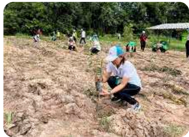
27 August 2023, the Company’s representative participated in “TCC Tree Planting (2nd Year) in the Community Forest Project” at Ban Tha Udom, Kabinburi District, Prachinburi Province. On Thursday,