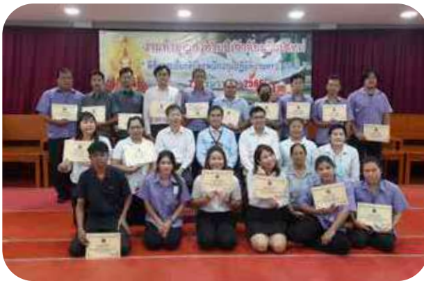
On Thursday, 21 December 2023, companies in the Saha Union Group in Bang Chan District organized a New Year's Eve-New Year's Day merit-making ceremony and an award ceremony for employees who worked diligently for ten years.