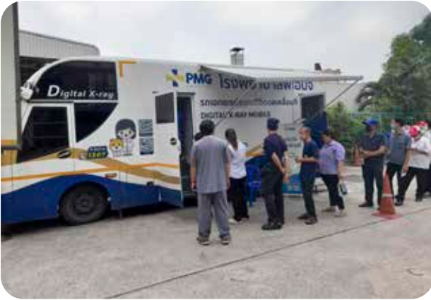
On Tuesday, 26 September 2023, PMG Hospital provided annual employee health examination services for 2023.