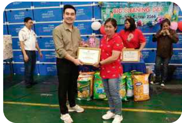
On Thursday, 28 December 2023, in the Big Cleaning Day activity, executives gave the Gemba Walks award to representatives of the winning organizations.