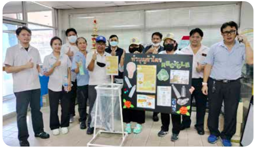
18 October 2023, employee representatives invited fellow employees to join in “Change Garbage into Merit” with Wat Jak Dang in Samutprakarn Province by accepting donations of clear plastic bottles to recycle into monks’ clothing, etc. On Sunday,